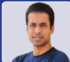
Mr. Gopi Chand Pullela Executive Member Badminton Player & Coach