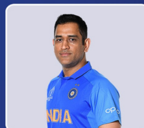
Mr. M. S. Dhoni Honorary Member Cricketer